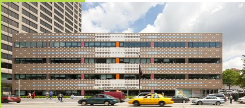
The former ISI headquarters building at 3501 Market Street, Philadelphia, PA

tion." He created the Eugene Garfield Foundation in order to find "lasting solutions to complex social problems," with programs focused on collaborative networks, environmental sustainability, and community revitalization.