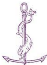
Beta Phi Mu Honor Society