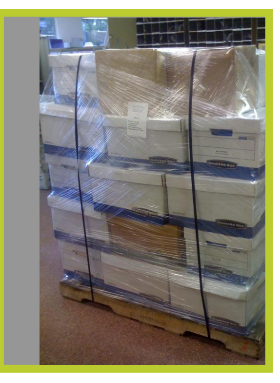
Beta Phi Mu boxes wrapped and ready to be shipped from Florida State!

We look forward to working with all of you!