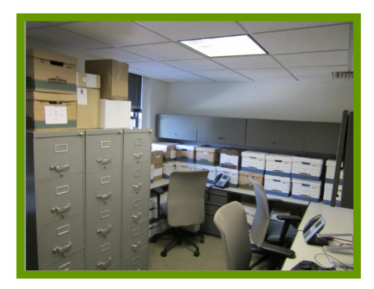
The new BPM office officially set up at Drexel University!