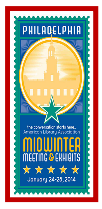
January 24 – January 28, 2014 American Library Association Mid-Winter Meeting Philadelphia, Pennsylvania