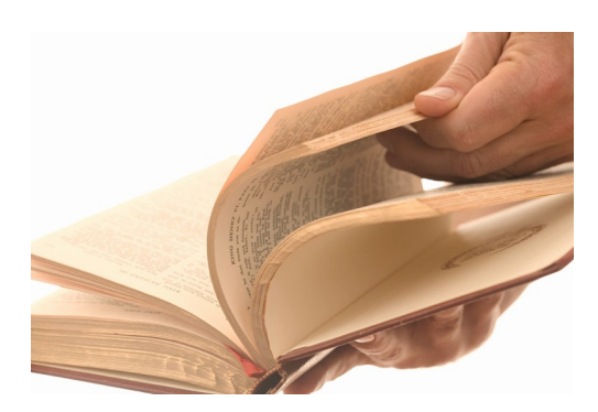
The Beta Phi Mu Scholars Series is our latest initiative in scholarly publishing

Beta Phi Mu's current scholarly publishing program is the Beta Phi Mu Scholars Series, published in conjunction with Rowman & Littlefield. Works published in the Scholars Series follow the Society's purpose and must be substantive advancements to the field's commitments to scholarship, leadership, and service. All Beta Phi Mu members are eligible for a 20% discount on Scholars Series titles. For more information, see: www.betaphimu.org/scholars-series.html