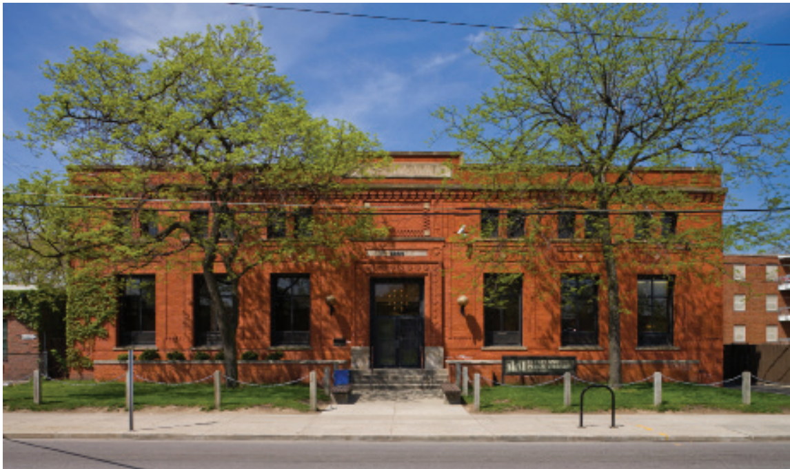
Sterling Library Branch of the Cleveland Public Library System

As we all know, there are so many facets of the profession and so many bright and forward-thinking students in schools now. As long as we listen, welcome new ideas and meet the needs of our patrons we will be here in 2118.