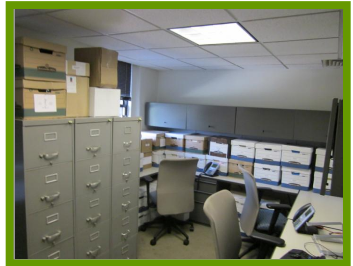
The new BPM office officially set up at Drexel University!