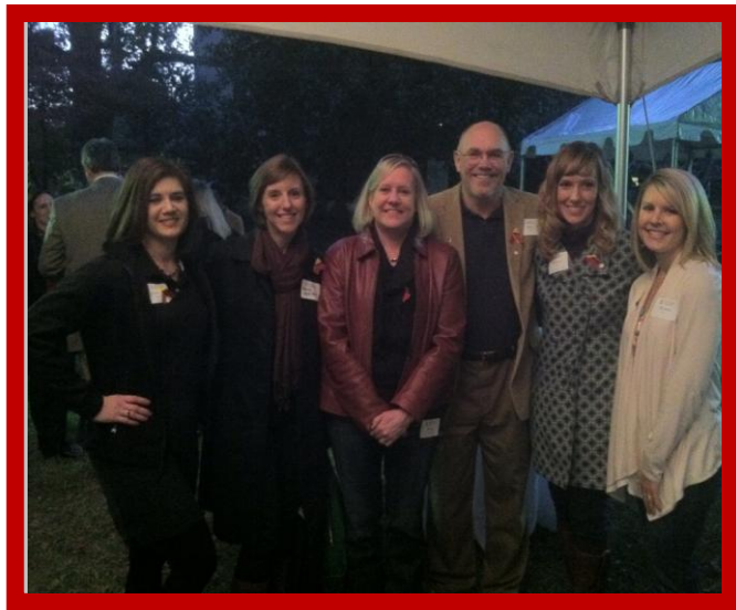
Beta Omega celebrates Homecoming!

The photograph to the left was taken at a homecoming event for University of South Carolina where Beta Phi Mu, Beta Omega chapter members gathered and were recognized by the Dean for the 30th year of our chapter's beginning at the School of Library and Information Science.