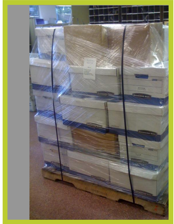
Beta Phi Mu boxes wrapped and ready to be shipped from Florida State!

We look forward to working with all of you!