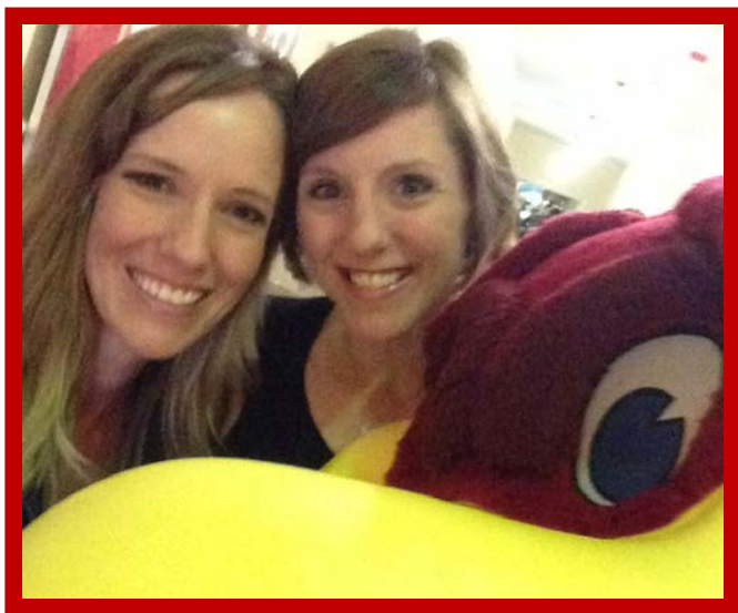
Beta Omega celebrates Homecoming!