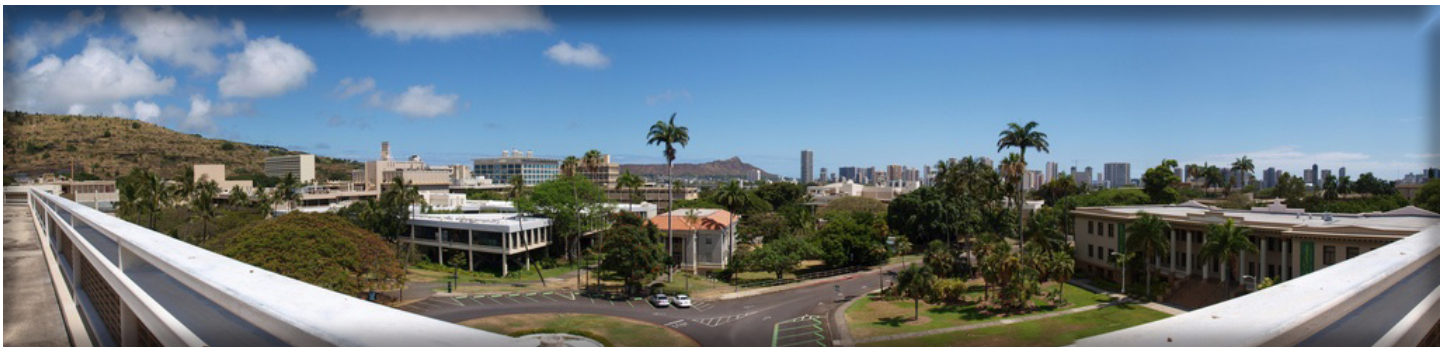
View from the UH-Manoa Student Services Building Looking across the upper campus you can see Honolulu and Diamond Head in the distance!