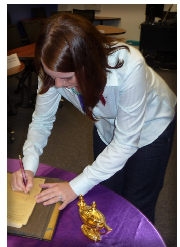
Ginger signs The Great Roll